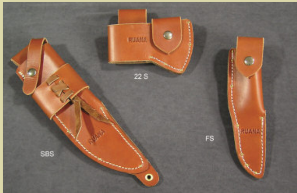
A NO FRILLS, FUNCTIONAL SHEATH ACCOMPANIES ALL RUANA KNIVES AND THE HATCHET.

Ruana sheaths are made from full grain English bridle leather that is drum-dyed and lightly hot stuffed with an extra tallow top dressing. They are sewn with durable, bonded high strength nylon thread and brass nailed for safety. All knives, hatchets and Bowie knives come with the sheaths shown on this page. Sheaths can be purchased separately